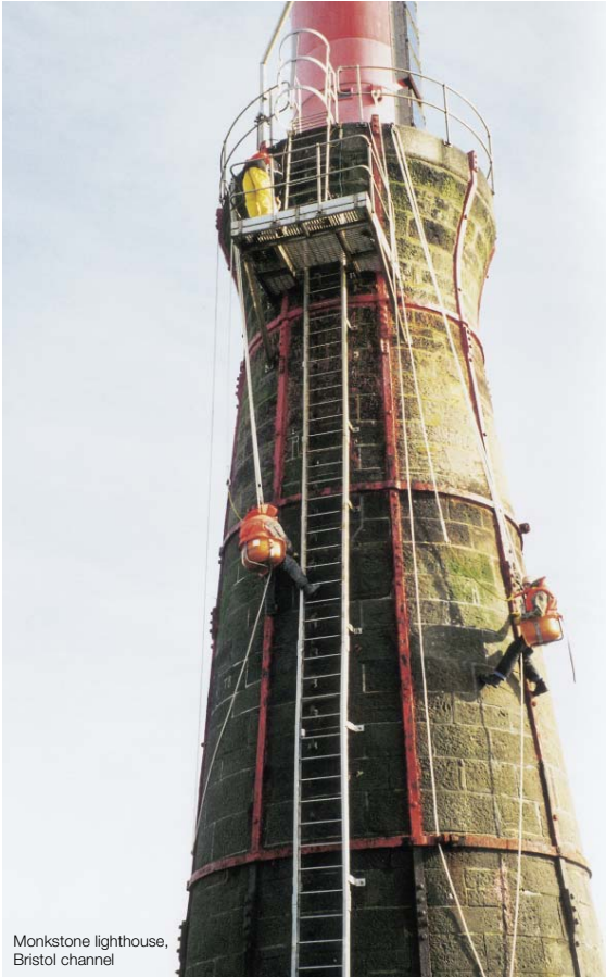
Monkstone lighthouse, Bristol channel

EasiPoint Marine mortar can be injected into joints as narrow as 8mm and will penetrate to a depth in excess of 50mm, completely filling the deepest of joints.